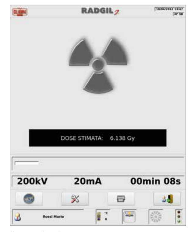
Dose setting view