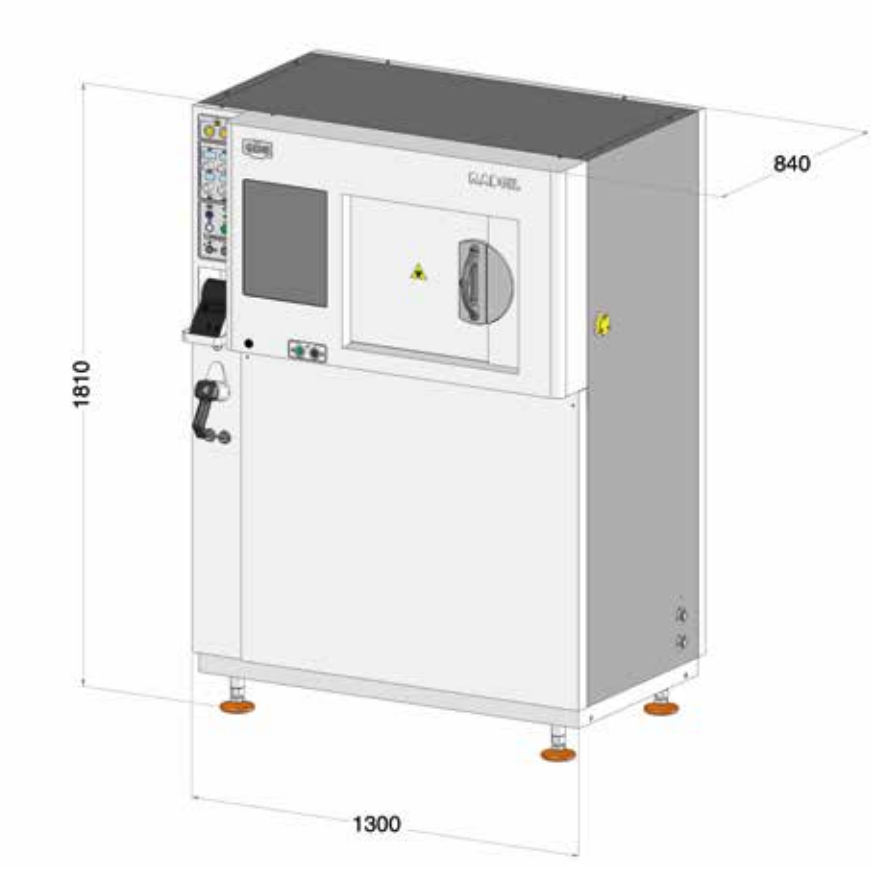
Dimensions in mm, weight 1400Kg